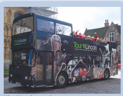
The Lincoln tour bus.