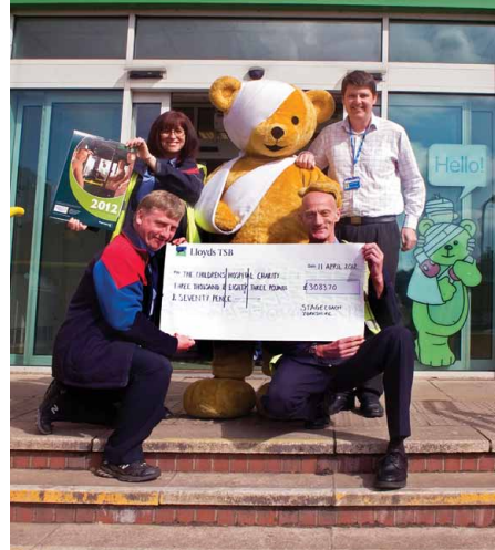
Stagecoach staff hand over the cheque to The Children's Hospital Charity.