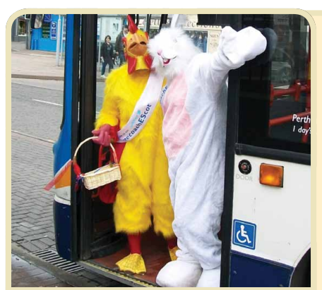
The Easter Bunny and Easter Chicken travel with Stagecoach