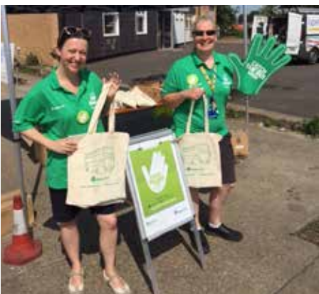
Stagecoach South East employees handed out Catch the Bus Week giveaways in Thanet