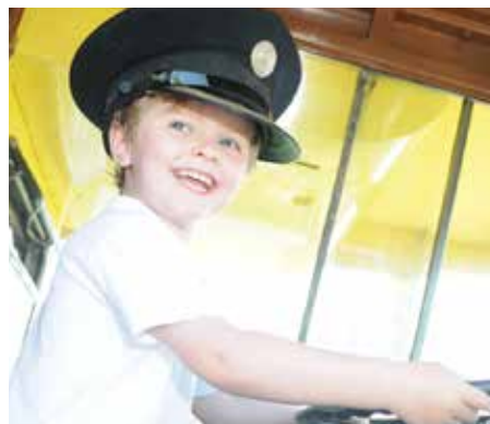
This youngster was in the driving seat when Stagecoach took a vintage vehicle and a new bus to Mortimer Primary School in South Shields