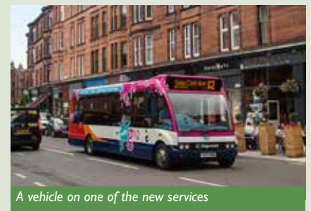
A vehicle on one of the new services