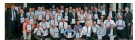
Congratulations to all of the long-serving employees

This year, 86 long-serving staff were acknowledged after accumulating an impressive 2,475 years of service between them, and each one was recognised for their prolonged hard work and commitment over the years at a celebration dinner and awards ceremony.