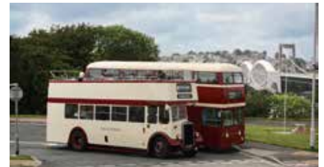
Passengers enjoy a ride on two of the vintage buses at the rally

STAGECOACH South West recently won two prizes for its heritage vehicles at the Plymouth City Transport Preservation Group’s 2015 Plymouth Bus Rally. The 1956 Leyland PD2 open top bus won the award for best preserved bus pre 1966 while the Devon General Leyland Atlantean 872ATA vehicle won the best preserved bus in the show award. Well done to all involved.