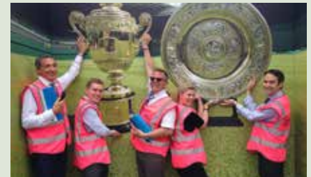
A winning performance at Wimbledon