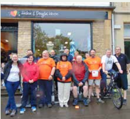
Staff from Witney depot took part in the challenge